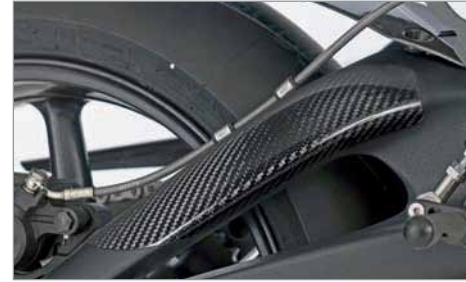
SWING ARM COVERS - CARBON FIBER High Gloss Carbon Fiber scuff guards, supplied with self adhesive fixings.