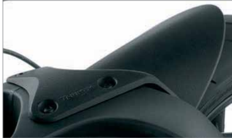
REAR HUGGER Textured black ABS hugger to protect the rear suspension unit from dirt and debris.