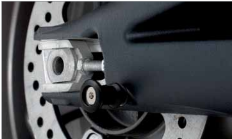
PADDOCK STAND BOBBINS - BLACK Black anodized paddock stand bobbins developed for use with hook type paddock stands.