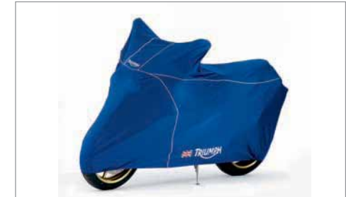
STRETCH MOTORCYCLE COVER Indoor Use Cover. Features internally "Teasled" fabric to protect paintwork.