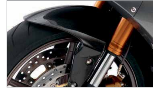
FRONT MUDGUARD - CARBON FIBER Carbon fiber alternative to standard part.