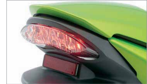
CLEAR REAR LED Clear LED rear light unit, direct replacement for the standard OE part.