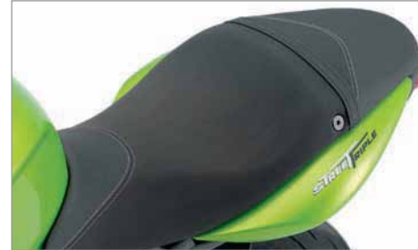
GEL SEAT Features twin fabric, contrasting stitch detail, Triumph branding and Gel layer for optimum comfort.