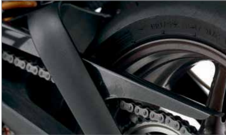
UPPER CHAIN GUARD - CARBON FIBER Carbon fiber alternative to standard part.