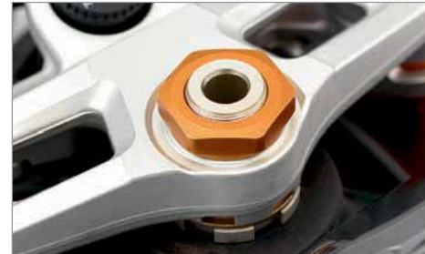
ANODIZED TOP YOKE NUT - GOLD Gold anodized Top Yoke nut offered to compliment the OE anodized fork adjusters.