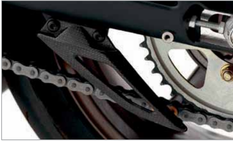
LOWER CHAIN GUARD - CARBON FIBER Mounts to existing swing arm lugs.