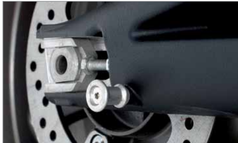
PADDOCK STAND BOBBINS - SILVER Clear anodized paddock stand bobbins developed for use with hook type paddock stands.