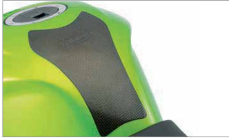
TANK PAD - CARBON FIBER High quality Carbon Fiber tank pad supplied with self adhesive fixings.